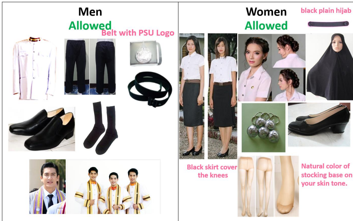
Illustration of attire for commencement ceremonies